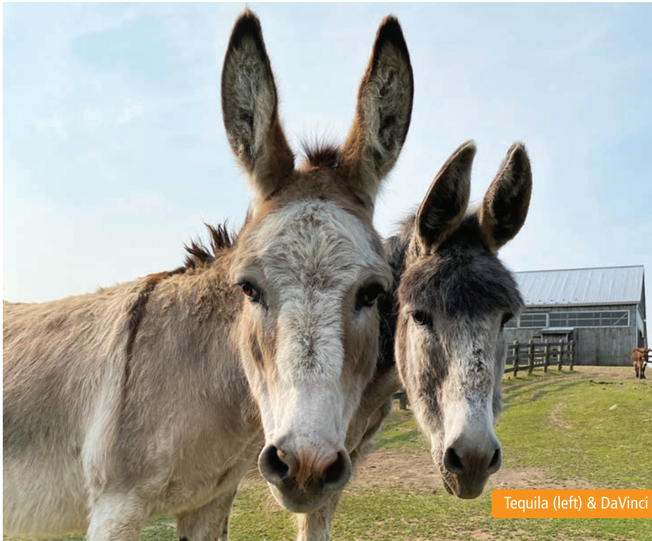
Tequila (left) & DaVinci