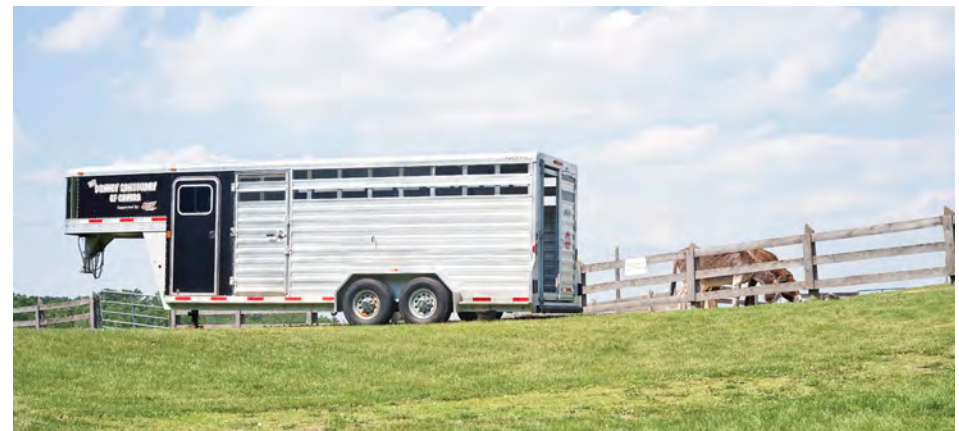
Our trailer helps us to more easily rescue and transport donkeys and mules. Our everlasting thanks, Jensen Trailers.