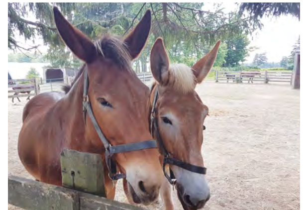
Kingston (right) and Leo (left)