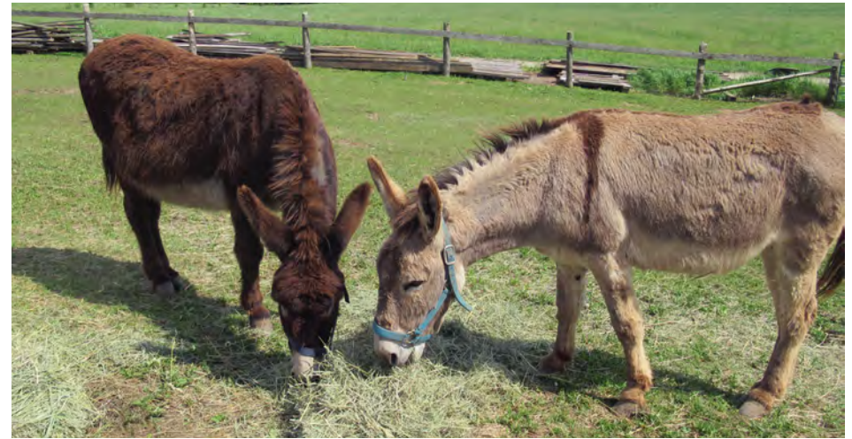
Above: Beans (left) and Burrrito (right)