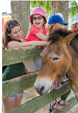
Reno accepts some excited attention.

We'd like to especially thank our donors, who along with passionate volunteers and dedicated staff, make this life-saving work possible.