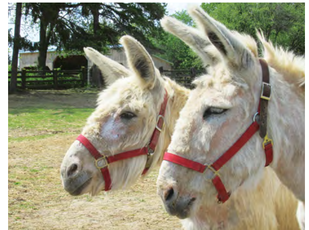
Watson (left) and Sherlock (right)