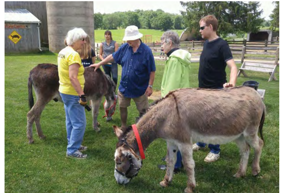
Our first Open Day "Celebrating Seniors" was a lovely day in the country. Join us September 13 th for our next one!

August marks the 25 th anniversary of The Donkey Sanctuary of Canada and we'd like to mark this milestone with our visitors - of course! On Wednesday, August 23 rd , the farm will be decorated in style, and we'll have celebration cake for everyone. We hope you can come for a visit and help us celebrate!